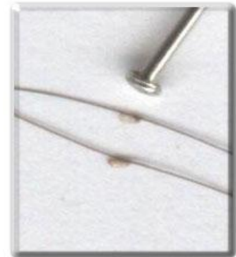
Attached nits enlarged